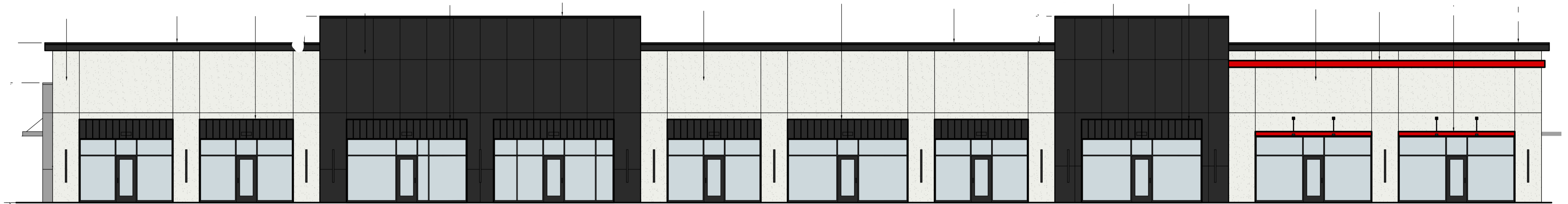
1 - SOUTH ELEVATION SCALE 1/8"=1'-0"