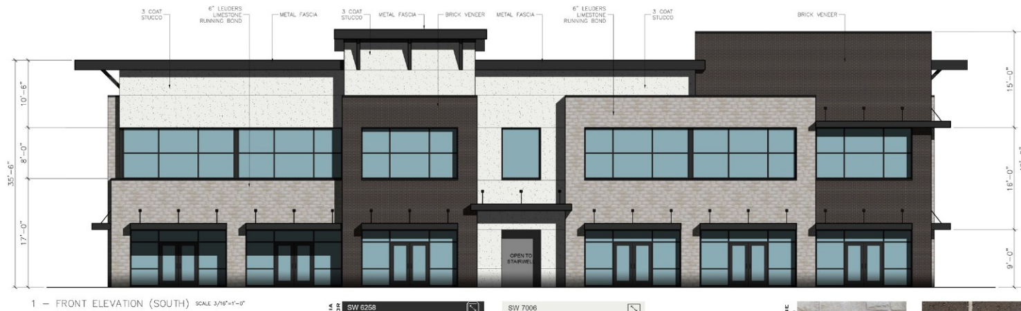
1 - FRONT ELEVATION (SOUTH) SCALE 3/16"=1'-0"