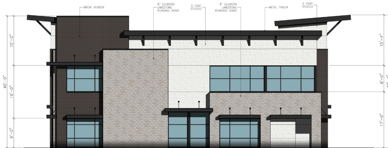
1 - SIDE ELEVATION (EAST) SCALE 3/16"=1'-0"